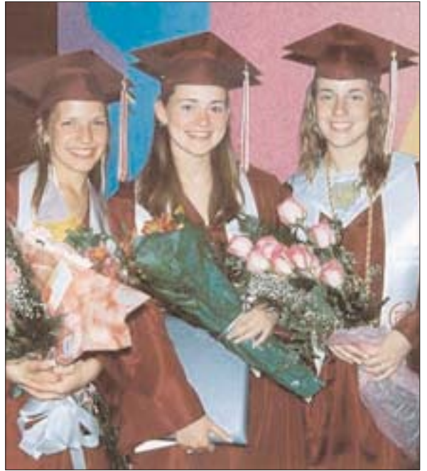
SICSMA grads aiming high hopes for the future