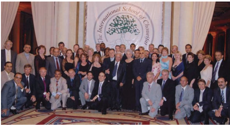
The Directors surrounding their excellencies the Prime Minister Mr. F. Seniora and the Minister of Education Mr. K. Kabbani