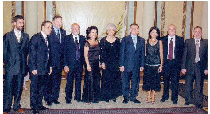
The Alumni Board with HE the Prime Minister and Mrs. F. Seniora