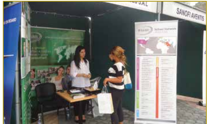
SES recruiters talk to interested students

Throughout the year, SABIS® recruiters allocate a large portion of their time to finding the best applicants available for vacant positions within the SABIS® School Network. One of the strategies that recruiters rely on in Lebanon is to participate actively in job fairs organized on university campuses across the country. This year, SABIS® recruiters participated in nine university job fairs in order to select applicants best-suited for full-time vacancies as well as candidates for the summer SABIS® Internship Program. Over a marathon three-week period, the SABIS® HR recruitment team set up shop at top universities in the country and met with over 500 eager students from the American University of Beirut (AUB), the Lebanese American University (LAU), Balamand University, L'Université Saint-Esprit de Kaslik (USEK), and the Lebanese University.