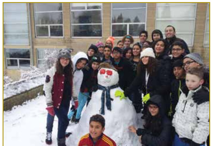
SAP participants build a snowman