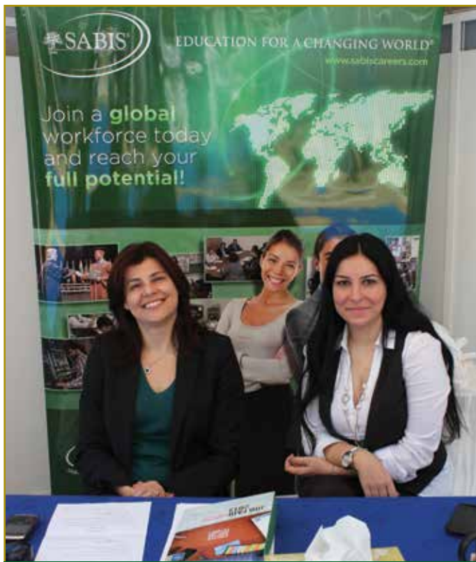
SES Human Resources staff at a university job fair