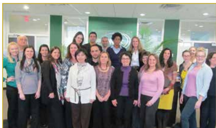
↑ Participants at the Bi-Annual Academic Conference in Minnesota, U.S.

Assisting each Regional Center in its role is the SABIS® Academic Development Department, which provides continuous support to centers on SABIS® books and resources, Core SABIS® pacing charts, lesson plans, curriculum-related issues, exam timetables, exam questions and databanks for exam creation, as well as customized programs for specific regions/schools.