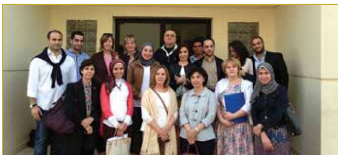
↑ Participants at the Cairo Regional Center Conference