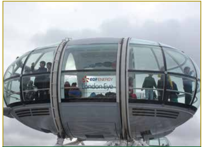
SAP participants enjoy a day out on the London Eye

For more information about the full year academic program at SIS-UK, visit www.sisuk-sabis.net . Details about the 2013-14 Study Abroad Program at SIS-UK will be released in September 2014. Watch the SIS-UK website for information or ask your local administration.