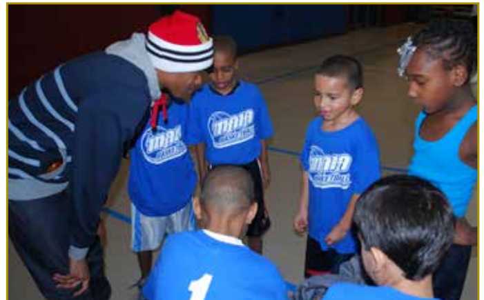
Student volunteer coach with his team