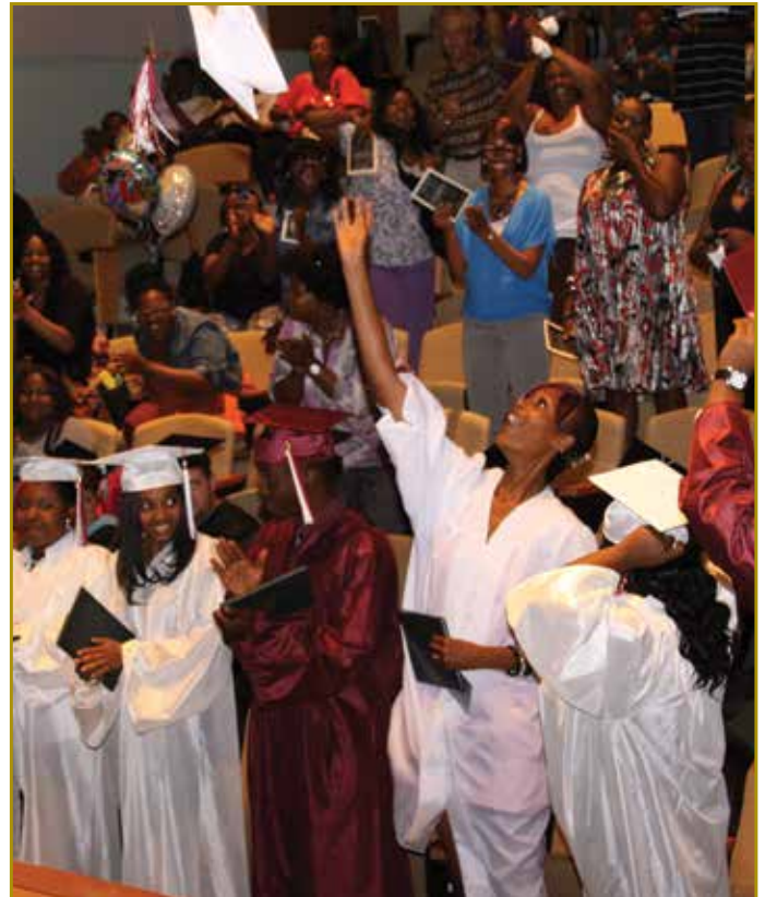
MAIA graduates its first cohort of students in 2012

For more information about MAIA, visit www.maia-sabis.net .