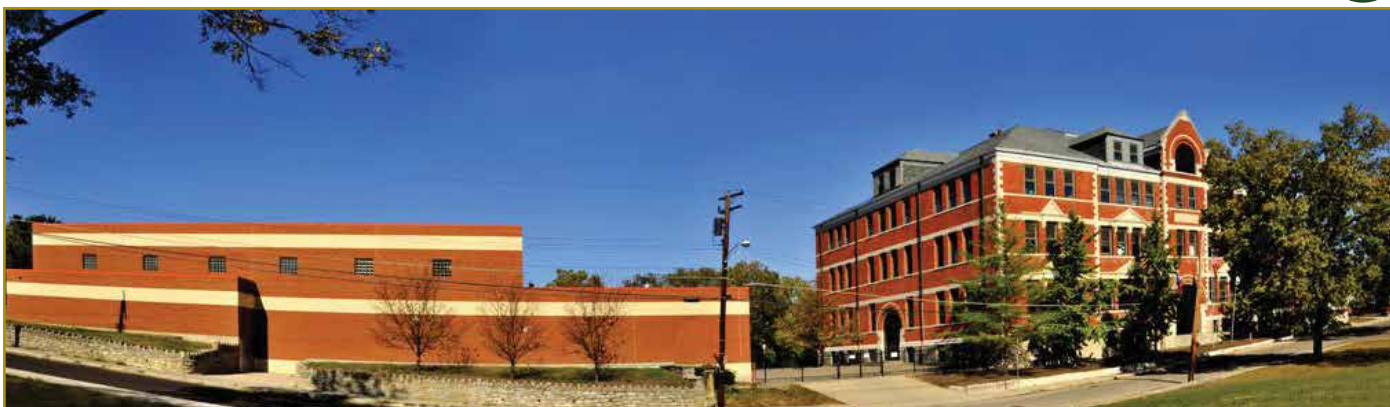
7 View of the Mount Auburn International Academy in Ohio, U.S.