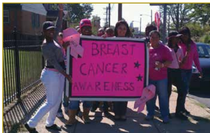
7 MAIA students raise awareness about breast cancer