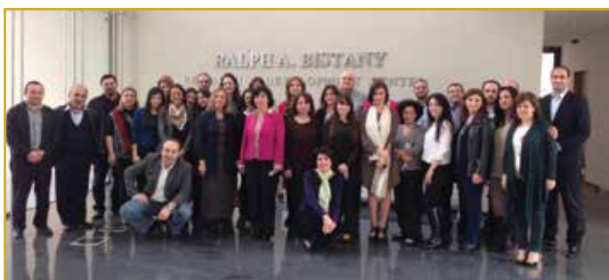
↑ Participants at the Levant Regional Center Conference

In addition to the Regional Center conferences, SABIS® also held its Bi-Annual Academic Conference in March 2013 at the SABIS® Educational Systems, Inc. offices in Eden Prairie, Minnesota, U.S. Over a four-day period, 26 individuals from the SABIS® Academic Development teams in the U.S. and Lebanon met to discuss the mathematics, English, and science curriculum implemented in member schools in the U.S. Throughout the conference, the team analyzed best practices in preparing students for state exams, ensuring the alignment of the SABIS® curriculum with the ever-evolving U.S. Common Core State Standards, as well as pacing charts and SABIS® books.