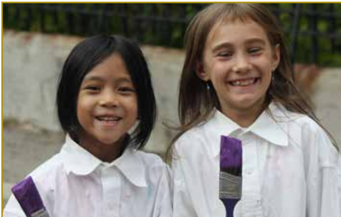
Grade 3 students at MAIA painting the school playground