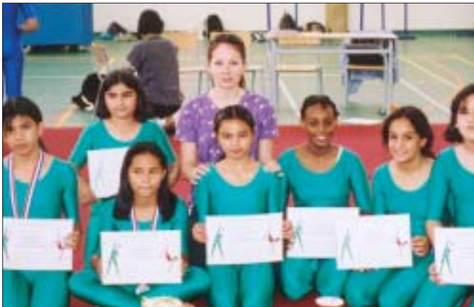
ISC-Ruwais Gymnastics Team

students to eat healthy food, and playground activities where games are organized among other things. The Junior School students have also worked very hard to make and keep their school clean and as a result proudly announced in a banner in the school entrance that they are studying in “the cleanest school in the world”.