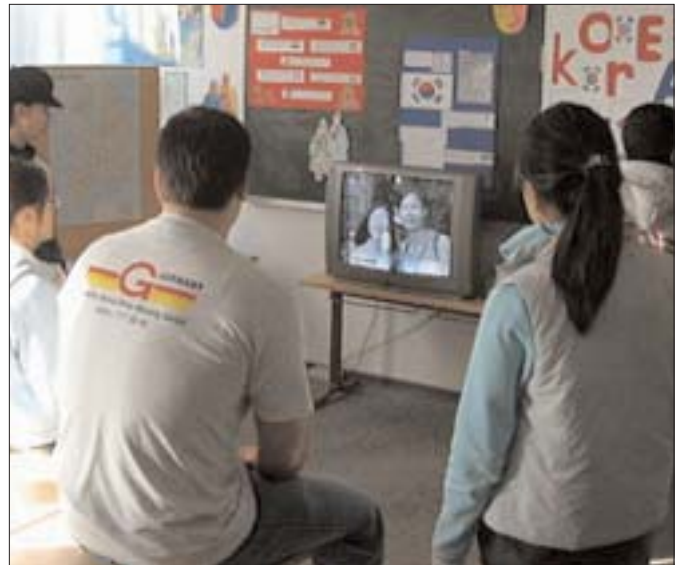
Several persons visited the focus room of Korea and took in a sample of Korean television

The high point of the week came on Saturday, November 8 th . The school was adorned with 46 posters. Focus country presentations were set up in classrooms. Visitors received a free t-shirt to commemorate the day's events. Students were given passports to take along to each focus country exhibit, where they could receive a stamp after learning a bit about the country. The day also featured this year's first ISF Drama production, 'Wild Things'. Visitors could also indulge in specialty cakes from many nationalities, could take in some performing arts events, and could mill about in the International Marketplace featuring over 20 different vendors and their wares.