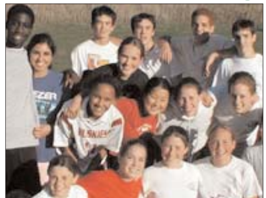
The cheerful team

ISM students and staff have a long-standing tradition of sports rivalry between them. Their competitions have often found their way onto the soccer field or the basketball court. Term one of the AY 2003-04 was no exception.