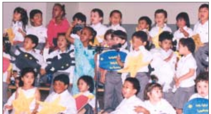
Music concert during the International evening with music selection from 18 different countries