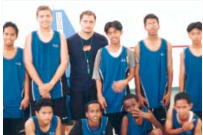
ISC-Ruwais Basketball Team

Last year awards for the girls gymnastics club members were numerous, totaling eleven gold medals and fifteen silver and bronze medals in inter-school competitions. The different teams also received six trophies in recognition of their excellent performance.