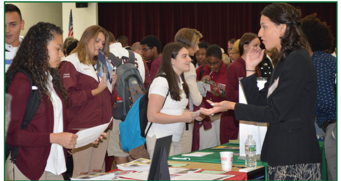
Students at SABIS® International Charter School signing up for SLO® clubs

Every year, SLO® prefects organize job fairs to introduce students to the organization's eight departments – Academic, Discipline, Management, Sports & Health, Activities, Outreach, Lower School, Social Responsibility – and encourage them to apply for a position.