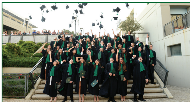
Class of 2017 graduates from SIS-Adma ready for the next chapter in their lives

In the early summer of 2017, SABIS® Network schools graduated over 1,700 students from close to 30 network schools. These students earned acceptances to 551 different colleges and universities in 47 countries around the world. Even more impressive is that 110 of the world’s top 200 universities as identified by the U.K. Times Educational Supplement accepted 2017 SABIS® graduates. These top-tier universities include McGill University and The University of British Columbia in Canada; Boston University, Cornell University, Harvard University, and Johns Hopkins University in the U.S.; University of St. Andrews, University of Cambridge, and University College London in the U.K.; Heidelberg University and Technische Universität München in Germany; Maastricht University in The Netherlands; University of Otago in New Zealand; The University of Sydney in Australia; and the Korea Advanced Institute of Science and Technology in Korea.