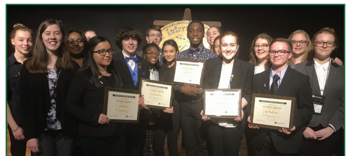
SICS Model Congress team pose for group photo

In addition to impressive and inspiring academic achievements, SICS students also excel in developing and pursuing their talents and interests. In sports, the school has had several of its teams and individual athletes recognized as champions in basketball, soccer, cheerleading, and wrestling. In intellectual competitions, the school is a perennial powerhouse at the American International College (AIC) Model Congress event. In the most recent Model Congress event, SICS students earned five of the 11 possible awards including Best Delegation; 2 nd place and a 50% scholarship to AIC; 3 rd place and a 25% scholarship to AIC; and two honorable mentions.