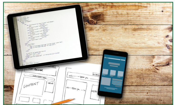
New coding courses coming soon!