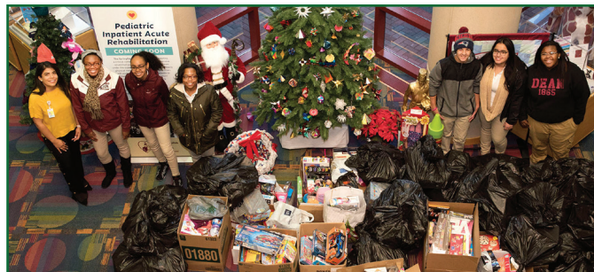
Students collected toys for children's hospital in Springfield