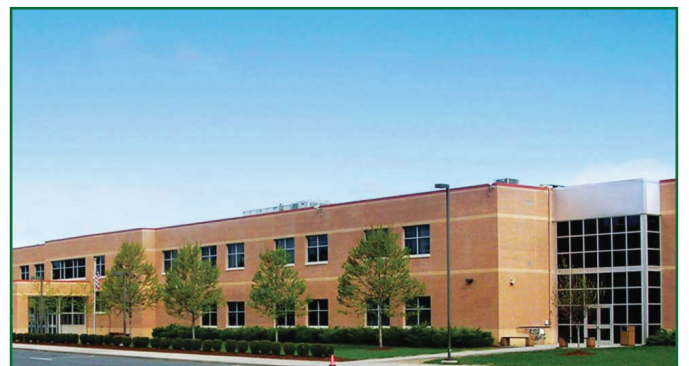
SABIS® International Charter School Campus

SABIS® International Charter School (SICS), located in Springfield, Massachusetts, has been changing the lives of students since it opened in 1995. The school, which was the first public charter school managed and operated by SABIS® in the U.S., made the world-renowned SABIS® private educational system accessible to