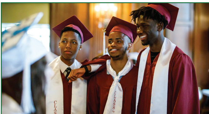
Group of SICS graduates at the 2017 commencement ceremony

As a member of the global SABIS® Network, SICS implements the proven SABIS® Educational System™. The comprehensive program includes a rigorous curriculum aligned to state and national standards, targeted instructional materials that support the learning process and foster the development of higher order thinking skills, and ongoing assessments that give everyone involved in the learning process a 360-degree view of progress. The system challenges students, supports their individual growth, provides student leadership opportunities, and creates a culture of high achievement for all.