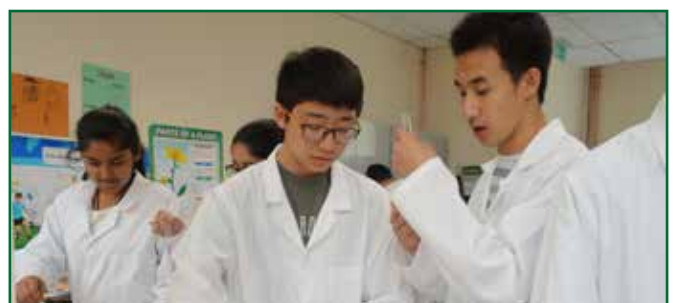
Students engage in educational science experiments

The 2015 SABIS® Educational Summer Camp included two sessions that offered varied academic programs to students in levels H to M (grades 6 to 11). A two-week program, which ran from July 20-31, 2015, focused on preparation for the Scholastic Aptitude Test (SAT I), which assesses students' skills in English and mathematics. A four-week program, which ran from July 20 to August 14, 2015, covered a wide range of subjects including physics, chemistry, biology, economics, English, French, and Arabic, as well as SAT I and II prep in English, mathematics, chemistry, physics, and biology.