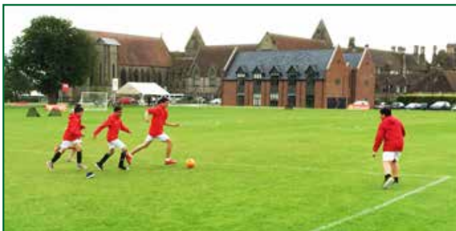
Campers get active at the Manchester United Soccer School, Old Trafford, England

As a new activity, interested students had the option to attend the Manchester United Soccer Schools (MUSS) Residential Soccer Camp. Twenty (20) boys and girls, aged 10 to 17, spent six days and nights at Denstone College, where they enjoyed 25 hours of league-quality soccer coaching and a trip to Old Trafford, home to the world-famous Manchester United soccer team. At the end of the program, students were issued an official team uniform and a certificate of participation from the MUSS.