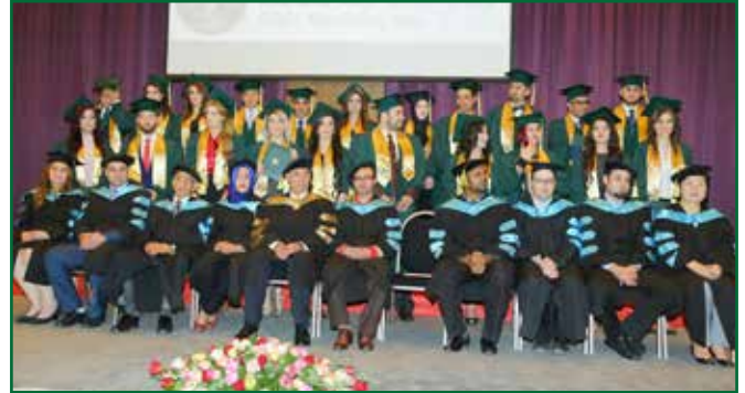
Class of 2015 graduates with SABIS® University President and senior faculty

Today, SABIS® University graduates are successful individuals who hold positions in a number of industries in both the public and private sectors. Graduates from SABIS® University are sought after by reputable firms in Kurdistan for their well-rounded education, exposure to a wide range of topics, and mastery of English. In fact, 98% of 2015 graduates have found full-time employment in their field of study. They are all united in their acknowledgment of SABIS® University as the institution that has given their careers a head start and put them on the path to success.