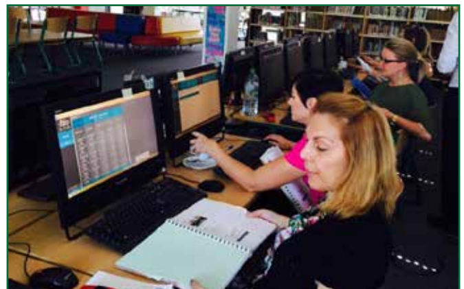
SPDI and ISR teams hard at work

As a global network that operates in 16 countries on four continents, SABIS® is committed to ensuring that all schools within the network deliver consistent results. This consistency is achieved through network schools' accurate implementation of the proven SABIS® Educational System, an effort supported by the SABIS® Professional Development Institute.