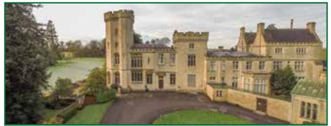
SABIS International School UK in Bath, England

In July and August 2015, the SABIS International School UK (SIS-UK), a member of the global SABIS® Network located in Bath, England, hosted the 9 th SABIS® Educational Summer Camp. The SABIS® Educational Summer Camp offers a program that blends academic learning with a wide array of activities and adventures and does so on a stunning campus nestled in the heart of the British countryside.