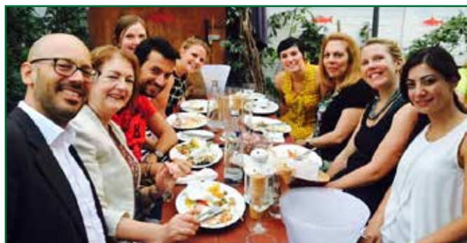
ISR and SPDI teams enjoy a group lunch during training

In Neuss, Germany, at the International School on the Rhine (ISR), a SABIS® licensee, SPDI held an across-the-board orientation for administrators, AQCs, and SABIS® Student Life Coordinator (SLC). The training took place over two days and covered a wide range of topics. SPDI explained the SABIS® philosophy and emphasized the various roles and responsibilities found in the SABIS® Network. SPDI also organized workshops that focused on themes like developing others, communicating for leadership success, and coaching for peak performance.