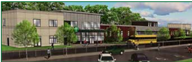
Rendering of the new Lowell Collegiate Charter School

Growth in the SABIS® U.S. network comes predominantly through the opening of one new school and the expansion of grade level offerings at another school. The newest school to join the network in the U.S. is the International Academy of Atlantic City Charter School (IAAC) located in Atlantic City, New Jersey. The public charter school opened its doors in September 2015 to 311 students in Kindergarten to Grade 3 and will add one grade each year until it becomes a full K-12 school. Further contributing to the network's size in the U.S. is the addition of a preschool at the International Academy of Flint in Flint, Michigan.