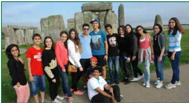
Summer camp participants visiting Stonehenge

the 2014-15 academic year and enabled them to focus on areas of improvement. In addition to being able to learn in a stimulating setting, students benefited from instruction delivered by experienced teachers from SABIS® Network schools who used the SABIS Point System® of instruction and SABIS® books, both with which the students were familiar.