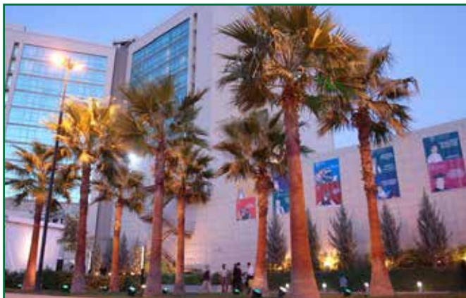
SABIS® University in Erbil, Kurdistan, Iraq

SABIS® University, located in Erbil, Kurdistan, first opened its doors in September 2009 and set out on a mission to provide high-quality education to a new generation of young men and women who could contribute to building Kurdistan. Today, starting its sixth year in operation, the university has built a strong reputation as a provider of top-quality tertiary education in the region.