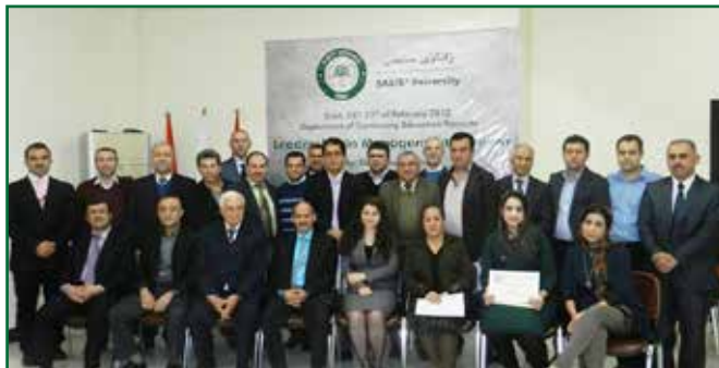
Leadership in Management seminar at SABIS® University

In addition to three colleges, the university also includes a comprehensive Continuing Education Department (CED), which seeks to serve the needs of professionals in Kurdistan. Through a wide range of professional seminars on offer, the CED offers local professionals the opportunity to update and develop their knowledge and skills and remain competitive in today’s ever-changing and challenging employment market.