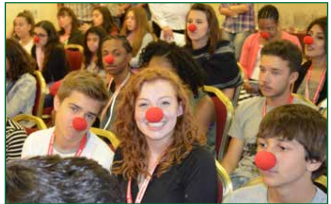
Participants attending a workshop at the 2015 SLTC

Sessions held at the International Academy of Flint and the International Preparatory Academy, two of the SABIS® Network schools in the state, taught participants valuable lessons on communication, motivation, and leading by example, among other things. Camp participants also got the chance to explore Michigan, visiting the Sea Life Aquarium and going by ferry to Mackinac Island.