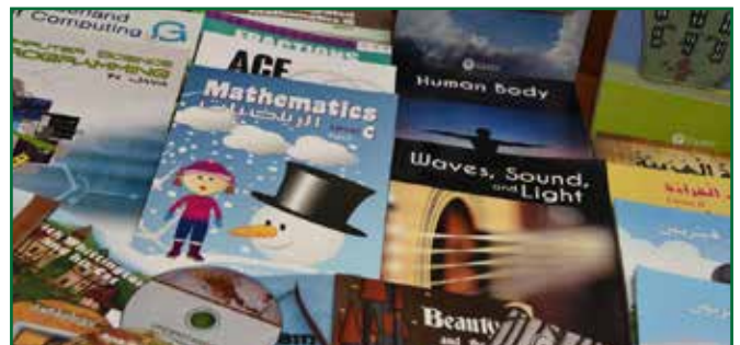
New titles in the SABIS® Book Series

The SABIS® Educational System is a comprehensive educational program that consists of a wide variety of tools to ensure that students are equipped for success. Among these tools is the SABIS® Book Series. The proprietary series, which is comprised of over 1,800 titles across all grade levels (preschool through Grade 13) and all subjects, ensures that the learning process is targeted, efficient, and effective. Designed to dovetail with the dynamic SABIS® curriculum, the series is updated and expanded annually by the SABIS® Academic Development Division based on changes in external exam requirements, feedback from teachers and stakeholders, and an internal review of materials.