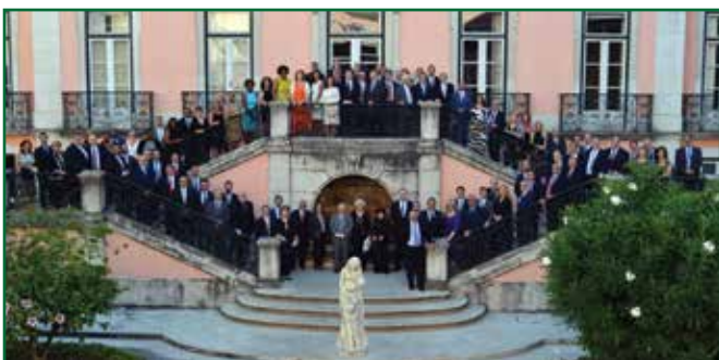
Annual Directors' Meeting in Lisbon, Portugal

Directors from SABIS® Network schools around the globe gathered in Lisbon, Portugal, in July 2015 for the network's annual Directors' Meeting. They were joined by senior SABIS® managers and the SABIS® Board for four days of meetings that served both as a culmination to the 2014-15 academic year and as a springboard for 2015-16.