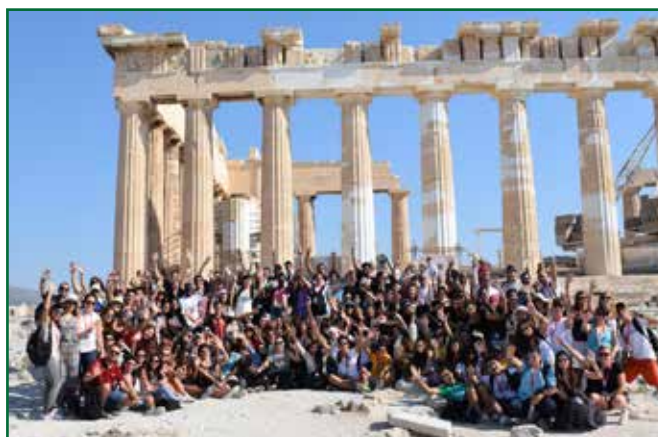
SLTC participants at the Acropolis in Athens, Greece

Every year, the SABIS® Student Life Organization® (SLO®) holds a training camp that brings together selected SLO® prefects from SABIS® Network schools around the world. As part of the camp, which is held in a different location each year, students have the chance to develop skills they can use to impact others and learn new skills that will help them take their SLO® and school environment to the next level.