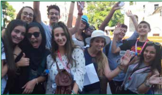
SLTC participants enjoy a day out in Athens, Greece

In addition to participating in activities and brainstorming sessions, the SLTC participants had ample time to enjoy the sights and sounds of Greece. They went on cultural heritage trips that included the National Gardens, the Acropolis, and Market Square, as well as cruises to Greek islands.