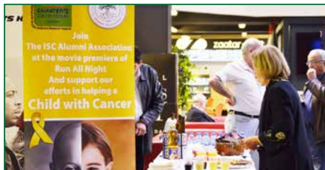
Movie premiere of “Run All Night” in Beirut, Lebanon

to become responsible, caring, conscientious, global citizens, a journey that continues after graduation and throughout life.