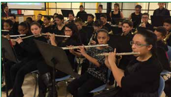
HCCS school band

Further indications of the school's success are visible in the Holyoke community and state. Putting their life skills to work, HCCS students have become role models in Holyoke through several community service initiatives. They have also proven to be leaders of change and earned recognition from former Massachusetts Governor Deval Patrick for an anti-bullying campaign that was implemented at the school.