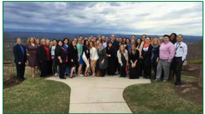
HCCS faculty, staff, and administrators pose for a group photo

Both schools have held events throughout the 2015-16 academic year to celebrate their milestone anniversaries. Kick-off anniversary events for both schools were held in late September 2015 and involved the entire school communities. Most recently, the celebrations continued with dinners for all staff members at each school.