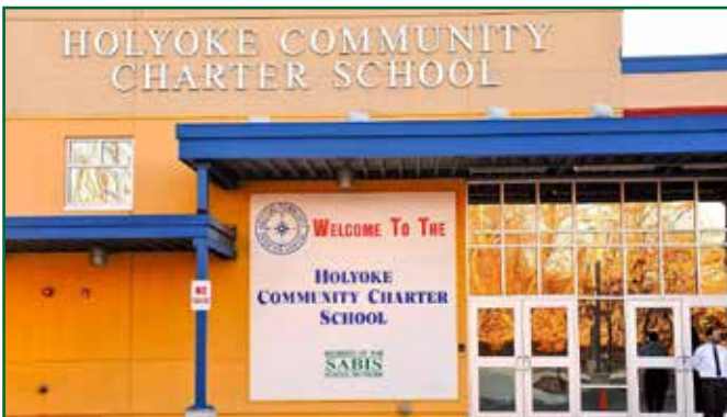
Holyoke Community Charter School, Massachusetts, U.S.

Holyoke Community Charter School (HCCS), a member of the global SABIS® Network, is a tuition-free, public charter school located in Holyoke, Massachusetts. HCCS is one of 12 SABIS® public charter schools that currently educate over 8,000 students in six states across the U.S. The K-8 school opened its doors on September 12, 2005, and has been enrolled to capacity (702 students) ever since.