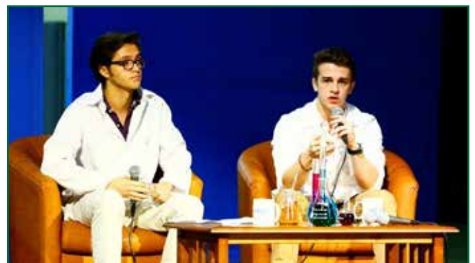
SLO® prefects discussing health topics at ISC Doctors

The objective of the event was to create awareness about the health issues that affect the lives of youth today and to promote general wellbeing in a fun, lively way that would resonate with the audience. In preparation for the event, SLO® Sports & Health Department prefects thoroughly researched and prepared presentations about their topics which included drug and alcohol abuse, fitness and nutrition, living with illness, asthma, and first aid tips – all of which they had pre-approved by health care professionals.