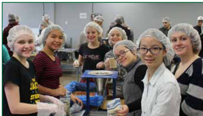
ISM students packaging food to help fight hunger

In recognition of the extent of ISM's investment in social responsibility, the school has been invited for the past three years to attend WE Day , an exclusive, invitation-only event that celebrates youth who make a difference. WE Day 2015 was another star-studded event that featured performers and speakers including Grammy® Award winning singer Ciara, Academy® Award winning actress Marlee Matlin, actor Henry Winkler, and Chelsea Clinton, Vice Chair of the Clinton Foundation. Seated to reflect the level of each school's community engagement, ISM was in the front row and received special recognition at the event as well as the honor of hosting the Kenyan Boys Choir, a traditional African male choir which sang at the 2009 inauguration of President Obama.