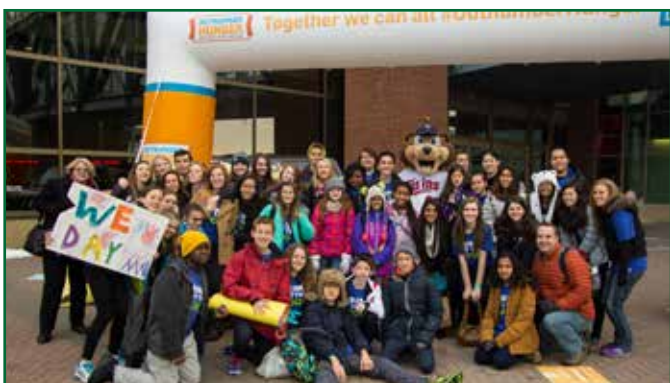
ISM students attend We Day and celebrate making a difference

Having been in operation for over 30 years, The International School of Minnesota (ISM) in Eden Prairie, Minnesota, has a particularly impressive track record of social responsibility that the school builds upon each year. With the SLO® Social Responsibility Department at ISM taking the lead, the entire school is involved in several meaningful projects.