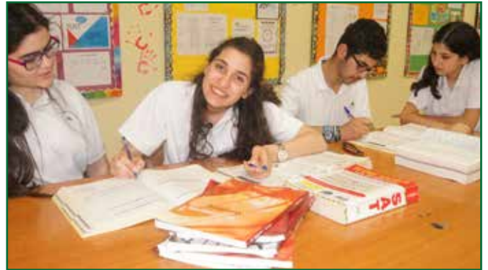
Saturday study group at ISC-Choueifat