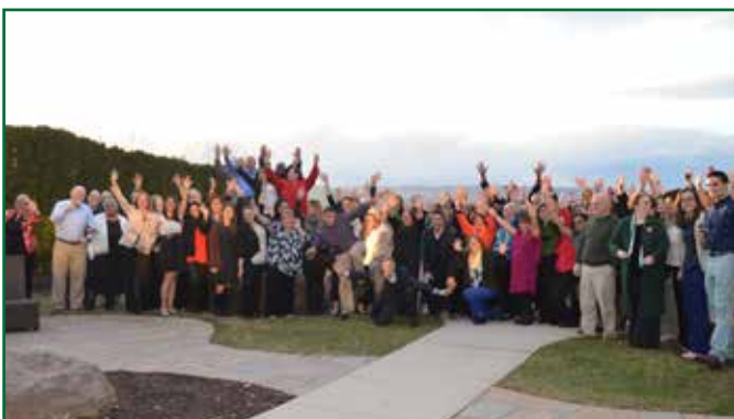
SICS team showing their enthusiasm for the future

SICS, one of the state of Massachusetts' original charter schools, opened shortly after the state passed a charter school law back in the mid-1990s and has been on a success path ever since. The K-12 school has been ranked among America's best high schools by U.S. News and World Report for six consecutive years. The school has consistently closed the achievement gap between minority and Caucasian students and between students from different socioeconomic backgrounds. In its 20-year history, the school has graduated over 1,100 students, all of whom have gained admission to college and several of whom have received scholarships. In the 2014-15 academic year, SICS graduates earned over $9.6 million in college scholarships.