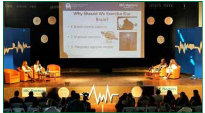
SLO® prefects on stage at ISC Doctors: Health Talks

On November 21, 2015, the SABIS Student Life Organization® (SLO®) Sports & Health Department at the International School of Choueifat (ISC-Choueifat) in Choueifat, Lebanon, planned and hosted a live talk show called “ISC Doctors: Health Talks.” Following the same formula as the popular television show “Doctors,” ISC-Choueifat prefects discussed a number of health issues in front of a live audience of more than 200 guests.