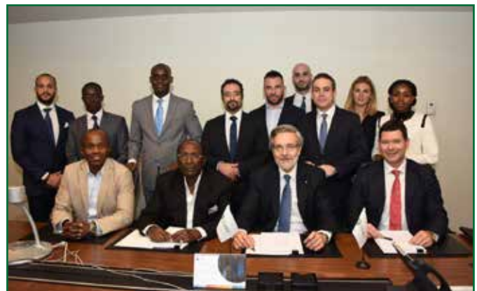
ACE leaders meet at SABIS® headquarters in Lebanon

In early January 2016, leaders from SABIS®, Investbridge Capital (IBC), and Centum Investment Limited (Centum), the parties that make up the ACE consortium, met at SABIS® headquarters in Adma, Lebanon, to firm up plans for the SABIS® International School – Nairobi. The meeting in Lebanon was the first time ACE members came together since July 2015, when they officially announced their partnership and revealed plans to open schools in East Africa, starting in Kenya.