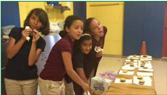
The HCCS Cooking Club hosting a bake sale