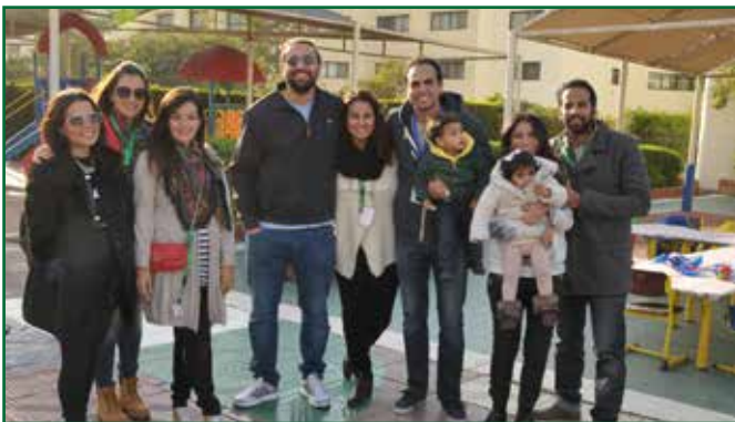
SABIS® alumni from Egypt enjoying SAGA event

Held at ISC-Cairo under the theme of “Let’s Get Together,” the event included speeches, live music, and lunch. The alumni and family members in attendance reminisced about their time at the schools, reconnected with former teachers, learned about SAGA updates, and rekindled friendships.