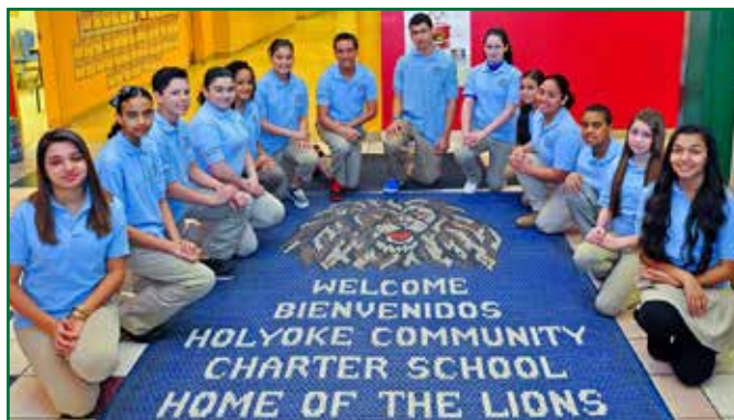
HCCS students create a positive and welcoming school environment