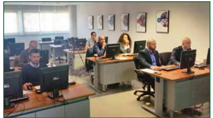
Directors learn to use SABIS® 360

SABIS® 360 for directors gives directors a bird's-eye view of what is happening at school through a dashboard with three key areas of focus: academics, discipline, and attendance. Based on parameters that are set regionally by SABIS®, SABIS® 360 notifies the director of areas of concern as soon as issues arise. Directors are then able to mobilize relevant staff, create an action plan, monitor progress of the plan, and follow up until issues have been resolved.