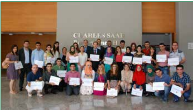
PPP teachers pose with their English certificates

SABIS®'s capacity building plan includes an English for Adults program, which assists teachers in the development of strong English language skills and strengthens their effectiveness in the classroom. As English is not the official language of Kurdistan, many teachers benefit from the English for Adults program, which helps them acquire first-language competence in English and in turn improves their students' fluency.