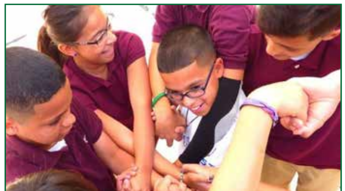
HCCS students celebrating friendship

Through SLO®, HCCS students can participate in a whole range of activities outside the classroom. Academic activities include peer tutoring, spelling bees, math contests, and learning vocabulary through "Scrabble." Students can also participate in music, arts and crafts, cooking, and fashion design clubs in addition to a wide range of sports for boys and girls including basketball, soccer, cheerleading, and scouts.