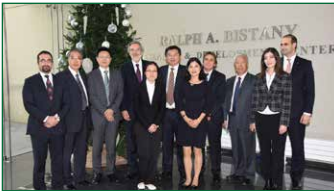
ULink College of Shanghai team at SABIS ® headquarters

Carefully designed to facilitate successful cooperation between ULink and SIS UK, the agreement provides for ongoing communication between the two schools. Prior to the arrival of ULink students in the U.K., a SIS UK educator of Chinese heritage will travel to Shanghai to participate in a 3-week orientation for eligible ULink students. This will help ensure that interested students have a clear expectation about the SIS UK academic program and life at a U.K. boarding school. When ULink students arrive at SIS UK, they will be accompanied by a ULink teacher, who will work with SIS UK to help them settle in before returning to Shanghai. Additional support for ULink's students will be provided by a Chinese houseparent employed by SIS UK.