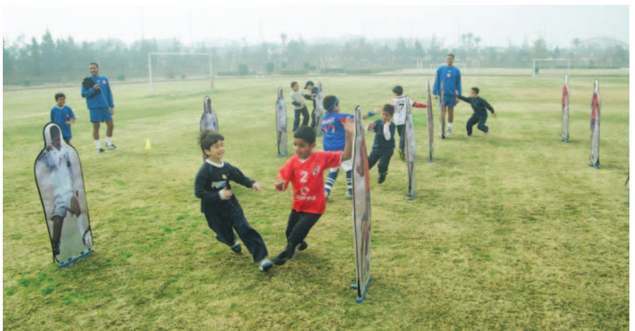
Some of the younger students warm up under the watchful eye of their coaches

It was Sir Bobby Charlton who started the soccer school.