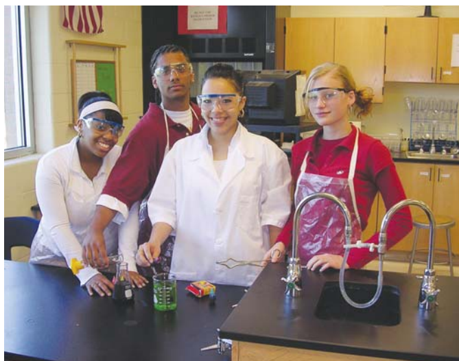
Four SICS students performing a science experiment

SICS students benefit from a rigorous environment based on the SABIS® curriculum, an interactive and dynamic curriculum providing a well-rounded education based on the mastery of English, mathematics, sciences, and world languages.