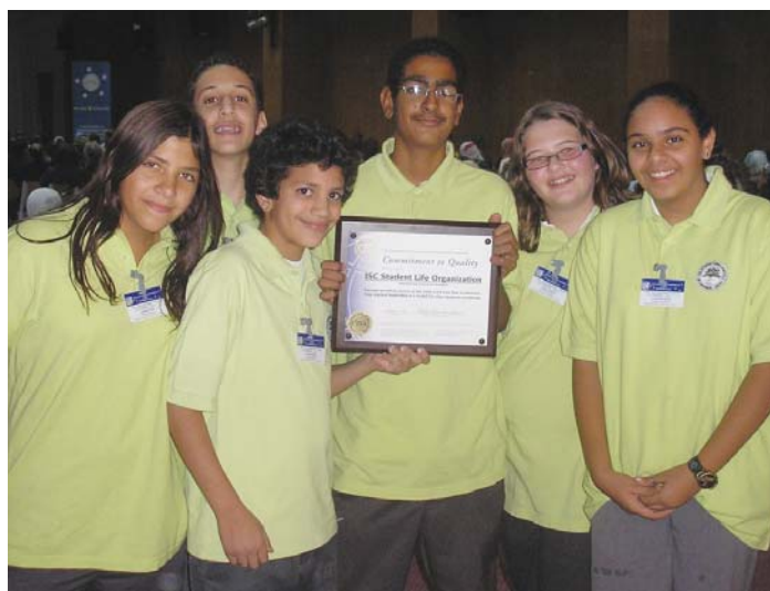
ISC-Cairo SL Prefects display CITA award

On November 11, 2006, the International School of Choueifat – Cairo played host to the Third Annual Educational CITA Five Star Conference . The Commission on International and Transregional Accreditation (CITA) is an organization that brings together educators from around the world and promotes school quality standards.