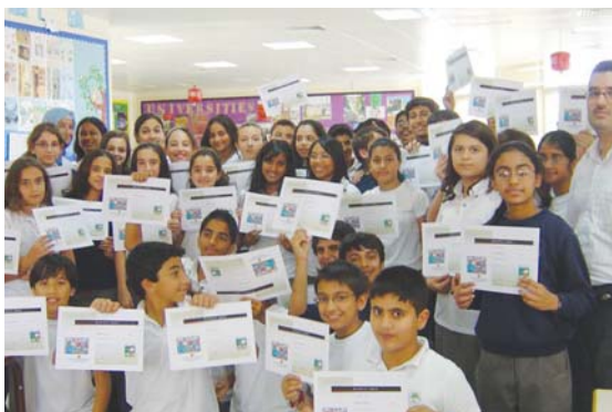
Awarding shadow teachers certificates

What is a SABIS® Shadow Teacher? SABIS® Shadow Teachers are prefects who train to become effective teachers so that they can help teach their fellow students. SABIS® Shadow Teachers may be used when a class has a substitute teacher due to the absence of the regular teacher. SABIS® Shadow Teachers assist the substitute teacher with teaching the material mandated by the regular teacher and, in some cases, will take the lead in teaching the material. The program is of great benefit to both the Shadow Teacher and the students, as substitute teachers often do not have time to prepare for the class and thus the availability of a Shadow Teacher can minimize academic disruption.