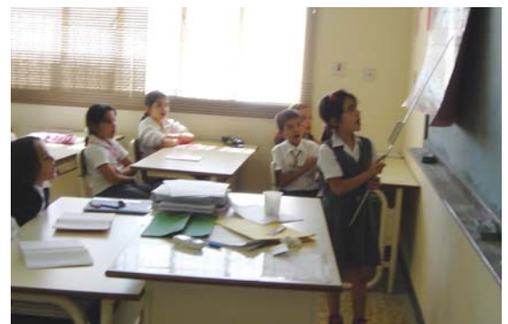
Grade 4 Shadow Teacher