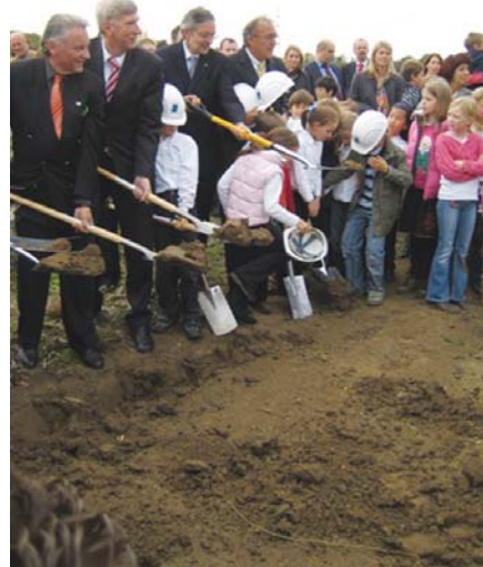
SABIS® President and ISR officials take part in the ceremony

For further information on ISR , please visit www.internationale-schule.de .