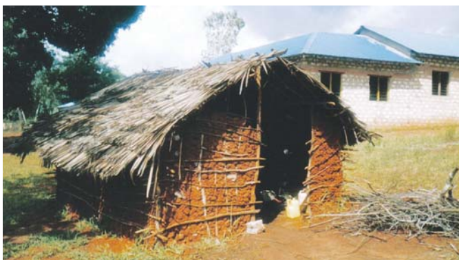
Chitsanze Primary School - Original huts used for classrooms

The Chitsanze Primary School is located near Mombasa and caters for 200 students from Kindergarten through the 8 th grade. The students and their families live in small mud huts which are situated around the school building. There is no water supply or electricity, so the families make a ten-kilometer trek to the nearest city to gather food and water.