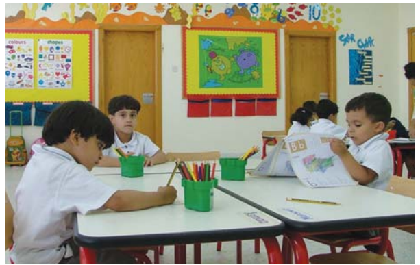
ISC-Khalifa City 'A' students in class

For more information on ISC-Khalifa City 'A' , please email iscadkc@sabis.net .