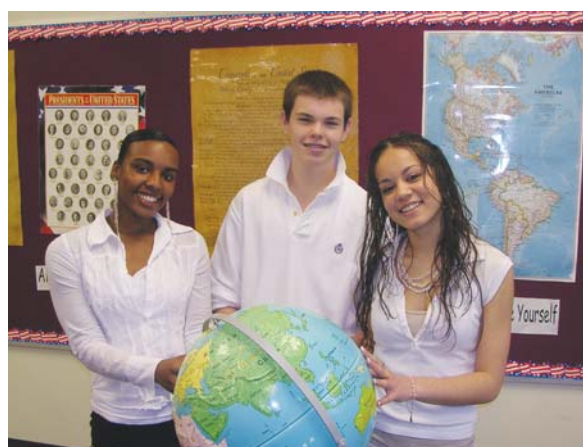
Student Life changing the world one school at a time

The SABIS® SLO™ provides students with an opportunity to shape their education and develop and practice life skills. Prefects are active in contributing to others in need through programs such as tutoring. SICS SLO™ students are also currently working on planning a variety of activities for the remainder of the year.