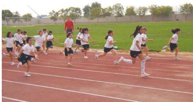
Participants in the marathon

"Everyone really enjoyed the various activities and each student took different things from each day," said one Grade 9 student. "It helps to increase the students' confidence and team-working skills. We look forward to other upcoming challenging activities."