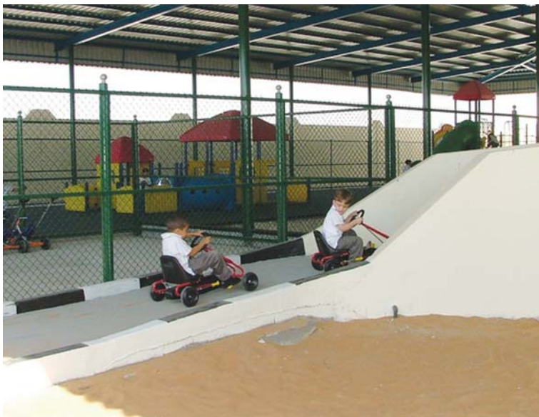
KG Car Track

The International School of Choueifat, Khalifa City 'A' is situated in Khalifa City, a mere twenty-minutes outside of Abu Dhabi, UAE. The new SABIS® member school officially opened its doors on September 3, 2006 and within the first two weeks, the student population increased to over 100 students. Current enrollment at the International School of Choueifat, Khalifa City 'A' totals 170 students of several different nationalities.