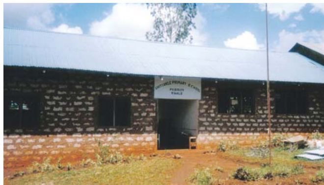
Chitsanze Primary School - Current Classroom