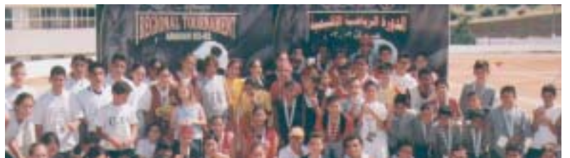
A gathering of the winners with their shiny medals

Students from the various SABIS® schools returned home with a combination of gold, silver and bronze medals in sprint, football, basketball and swimming.