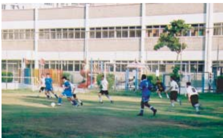
A scene from the games

Best of success for the rest of the year!