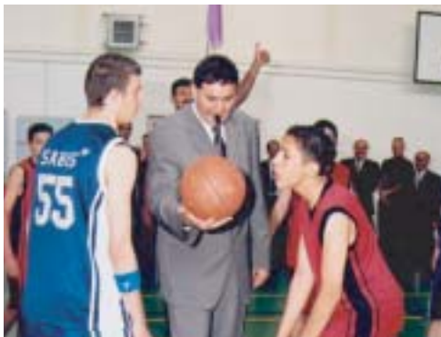
The minister "kicking-off the first basketball game between ISC- Amman and ISC Damascus

Students from the various SABIS® schools returned home with a combination of gold, silver and bronze medals in sprint, football, basketball and swimming.