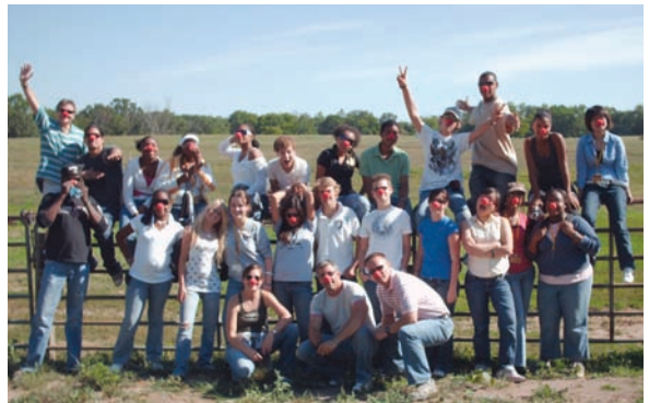
MN training camp

The US camp was held in Minneapolis, MN, from July 16 to July 27 and included participants from the SABIS® US and Germany schools. The ME camp was held in Cairo, Egypt from August 6 to August 13 and drew participants from the UAE, the Gulf, Egypt, and Levant schools.