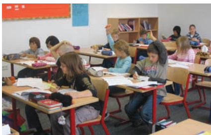
Unleashing the potential in the classroom

Through efforts of the SABIS® Academic Development Department, SABIS® schools from around the world have access to extensive databanks of questions for the automatic generation of different types of exams. There are banks of questions specifically designed for the production of the trademarked SABIS® Academic Monitoring System™ exams, as well as others for producing periodic exams and daily homework assignments. In the subject of mathematics alone, there are well over 100,000 questions in the databank. These databases can generate a variety of exams customized for different purposes such as gap analysis, diagnostic placement, and assessment of mastery of external standards. Questions in the databank are constantly reviewed and thousands of new ones are added each month.