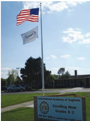
SABIS® Flag in Saginaw

IAS consists of ten classrooms, a gymnasium, and several offices and benefits from an ideal location in a quiet residential neighborhood. Renovations to the school building took place over the summer to accommodate this year's students and a plan is in place to expand its facilities to accommodate future growth of the school. One grade level will be added annually to the school's offerings, eventually yielding a KG-12 academy serving over 1,000 students.