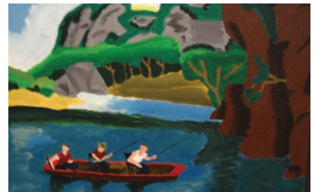
Talented Art Display

The well-rounded education at ISR also promotes students' talent by encouraging them to participate in musical performances and art projects. Visual art projects are displayed throughout the school for everyone to enjoy.