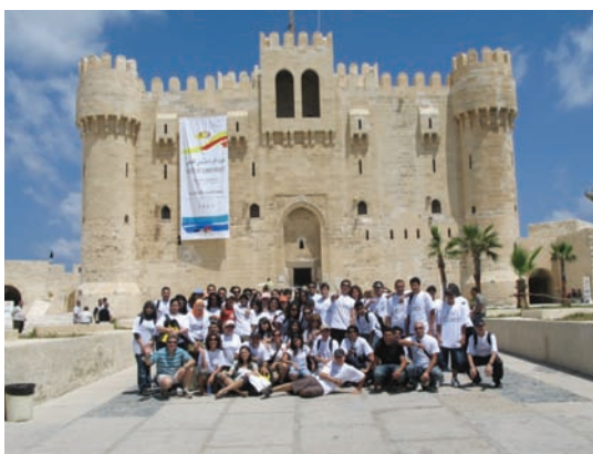
Cairo training camp

Both camps strongly emphasized the fundamental skills and knowledge of Student Life, leadership, team building, planning, the power of positive attitude, and much more. The camps also addressed the ways to implement the new SLO™ theme for the 2007-08 academic year - "The year of WOW" - and subsequently how to wow everyone in school with academics, planning, exciting new clubs, and with creative ideas to stimulate a learning environment for everyone. The sessions also gave students the opportunity to get involved in a variety of activities such as planning a free day and the closing ceremony.