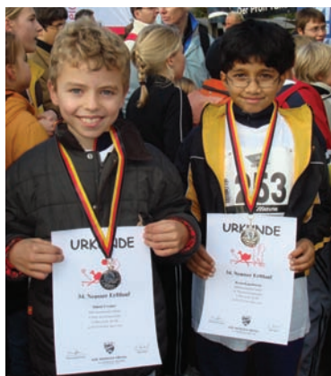
Excited Erftlauf Winners